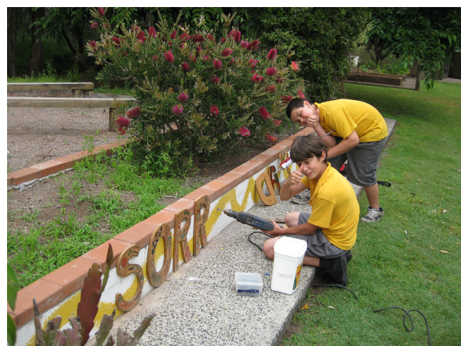
NAIDOC Week project at our Sorry Garden (above)

With our donations, they will receive a book to take home along with 80 books for their school library. The organisation holds a book party at the school to celebrate and raise awareness in the village.