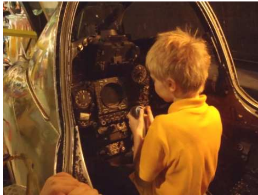
This recount was written in sections by the students.