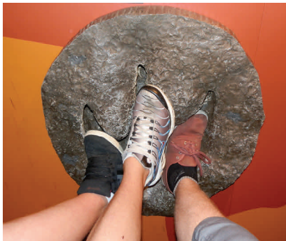
Three feet to one. Huge!