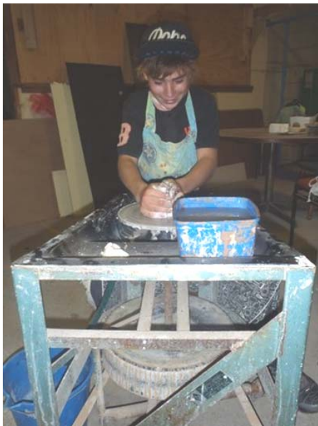
Christian in The Shed

Nine students from Hometown School took advantage of the opportunity to connect with the experts and took part in a combined total of over 30 workshops. The enthusiasm shown by all students was outstanding and a testament to their confidence and motivation to seek out employment information.