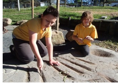
Hopetown students at the grinding rock at Wyong High School