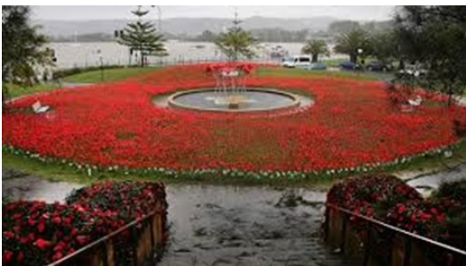
Rotary Park, Gosford

The poppy symbolises the spirit of integrity, respect and remembrance and the park project sends a message of gratitude to all Australians who have made sacrifices during wartime. Hopetown School is very proud to have contributed to this very special community project.