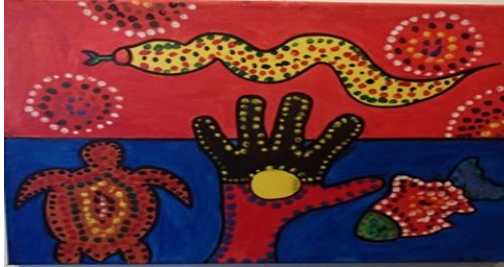
An example of from the Maliga Artworks Showcase

These students have had in-school activities such as stories from the Dreaming, art lessons to explore traditional designs and the history of the flag. They have also had several excursions to discover bush tucker, native animals and traditional Aboriginal dancing.